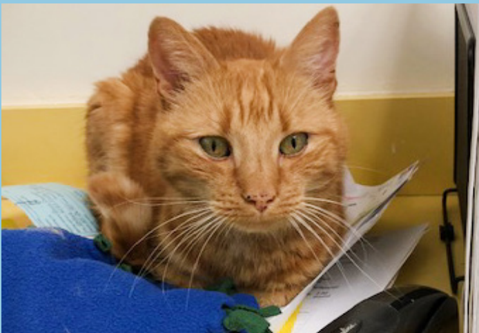
Alex has plenty of love left to give, and is a well-trained, easy-to-medicate trooper!

Alex loves to hang out with people and nap on their desks while they work. He gives kisses and head butts. Petting Charlie is like petting a cloud and burying your hands or face in all that nice soft fur is the most soothing thing in the world. He is the most huggable, snuggliest cat ever and tolerates frequent hugging incursions from ASAP staff and volunteers with grace. These two boys have charmed us all and we can't think of a better way to spend these colder, darker times than with the companionship of Alex and Charlie. ASAP will provide Alex's meds and special diet for life. All you need to do is provide the love.