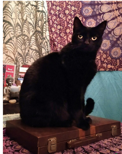
Spaz, an epic traveler on a suitable suitcase for her amazing journey.

By the way, have I ever mentioned how awesome microchips are? I never leave home without one! My black cat twin, Spaz, was reunited with her long lost mom all thanks to a chip! Gotta admit, that ending had me wiping a tear or two off my whiskers.