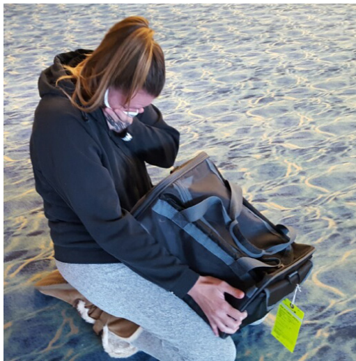
A tearful reunion in the Springfield airport.

It was really overwhelming. Simply amazing. Spaz put her lil forehead against mine like she used to do, right away. She has already claimed her spots all over the house, just like her old queenie self. The dogs are absolutely