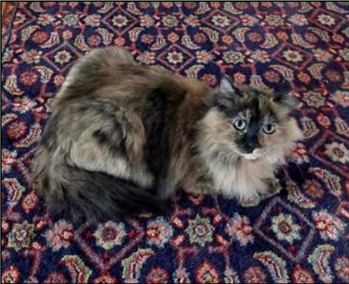
Carlotta loves to pretend she is camouflaged on her big rug.

Here are a couple of the many cats we had the pleasure of sheltering, nurturing, and eventually finding forever homes for: