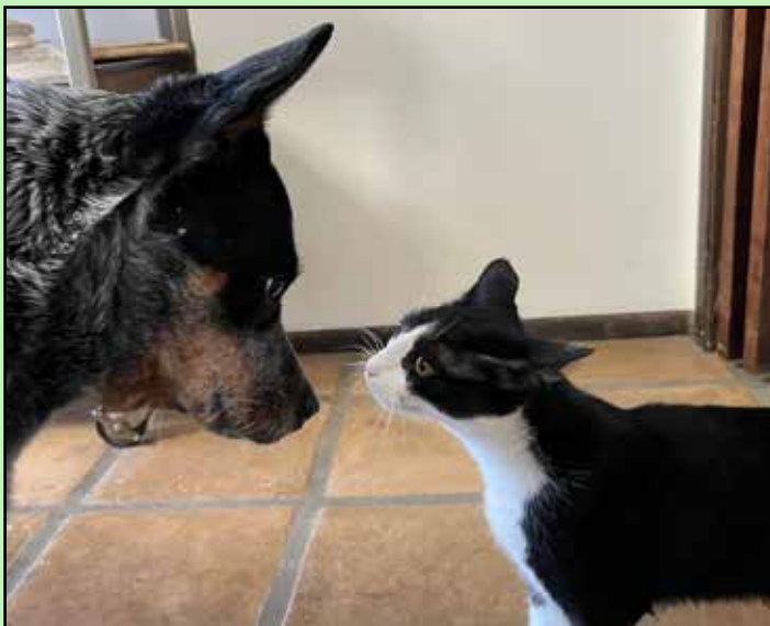
Not only did Angel gain a new home and family, she even got a new buddy: Moxie the dog.

"The first day or two, Angel was a little uncertain of our resident cat, Tiger, but after sniffing each other under the door, they quickly made friends and now sleep together regularly. Angel loves to be petted, held, and carried around, and she thinks a brush is for play rather than brushing. She is playful and affectionate, and has an insatiable appetite for attention and love."