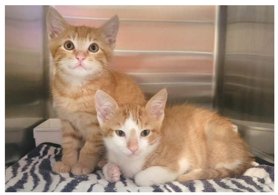
Spice and Seed, featured in our collaboration with the State Street Ballet, wait patiently in ASAP's Vet Room.

After spending weeks or even months with a dedicated ASAP kitten foster, kittens are spayed or neutered as one of the final steps before being adopted into its forever homes. Saving the lives of hundreds of kittens that pass through our veterinary suite every year is simply not possible without the dedicated staff, volunteers, and donors of ASAP.