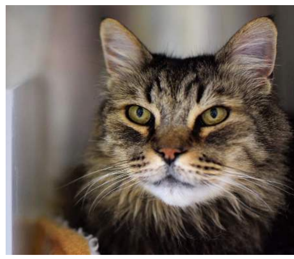
Bringing joy to so many was Joy's greatest gift.

Ya know, there are a lot of special days coming up this holiday season. With the ASAP Cats 2022 Calendar , you won't miss a single one! A very special day is November 30th— Giving Tuesday! Other than Black Cat Appreciation Day, Giving Tuesday is one of my favorite days