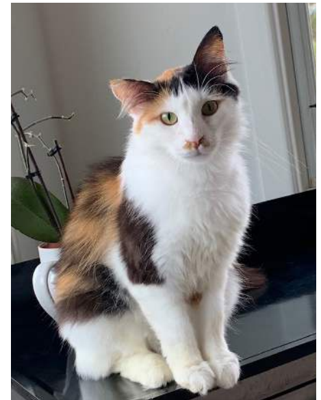
Sweet Jane, in her cozy foster home, after a harrowing journey to ASAP.

In the meantime, I gotta tell ya about some of these amazing cats that need homes right meow , like Jane, featured on page two. She had such a scary time with a motorcycle accident, then traveled all around the world to get to ASAP. But it doesn't stop her from being one of the sweetest girls I know! And Pax, on page six, who's dealing with diabetes and is looking for a patient and understanding family who can help him continue his treatment.