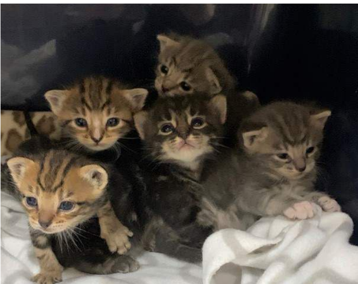
We're so grateful to the members of the community who so gleefully assist the ASAP team with trapping vulnerable kittens and queens, and always look out for the best interest of the cats.