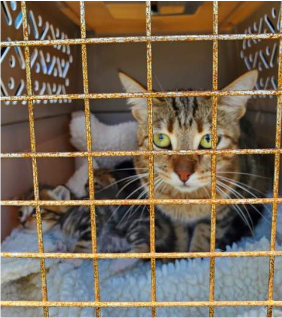
The mother cat and her kittens, being safely carried to a foster home where they can grow into lovely adoptable kittens.

Nearly every day ASAP answers a call from someone in the community that finds a cat where they least expect it. When kittens are involved it's crucial that we step in to make sure both the queen (mother cat) and her litter have a safe home where they can grow and thrive.