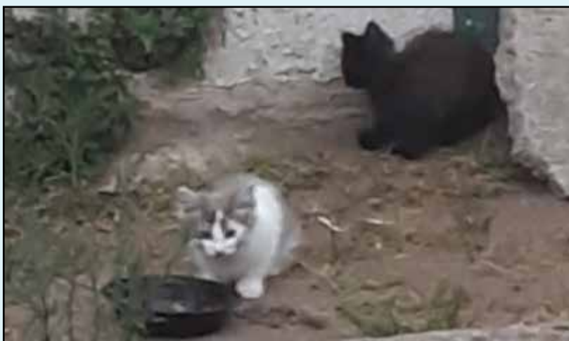
DOROTHY AND HER KITTENS