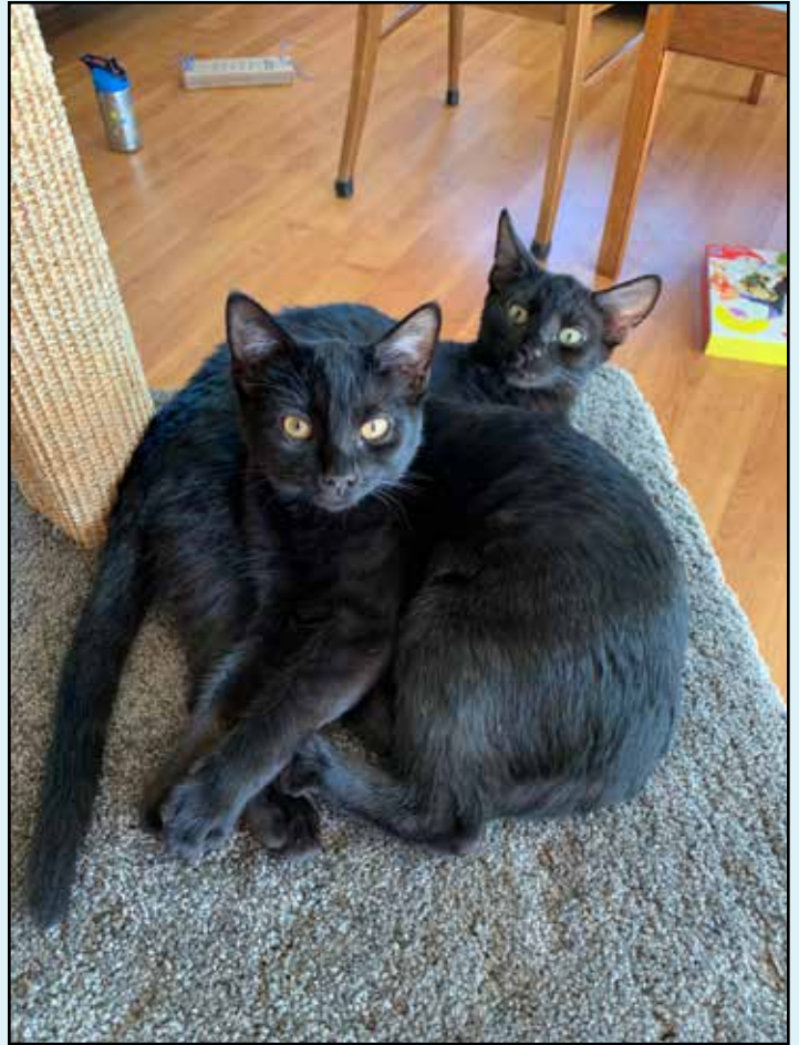
ESPRESSO & RISTRETTO