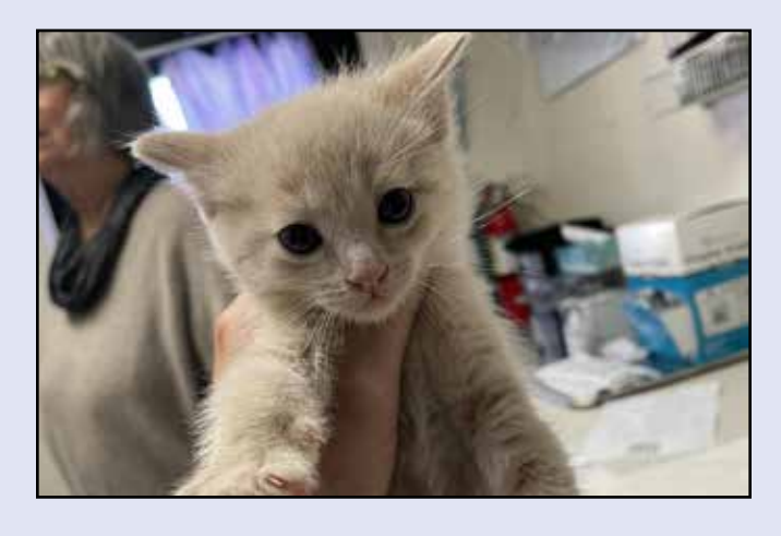
Sandy has never seen the beach, but she still loves taking warm naps.