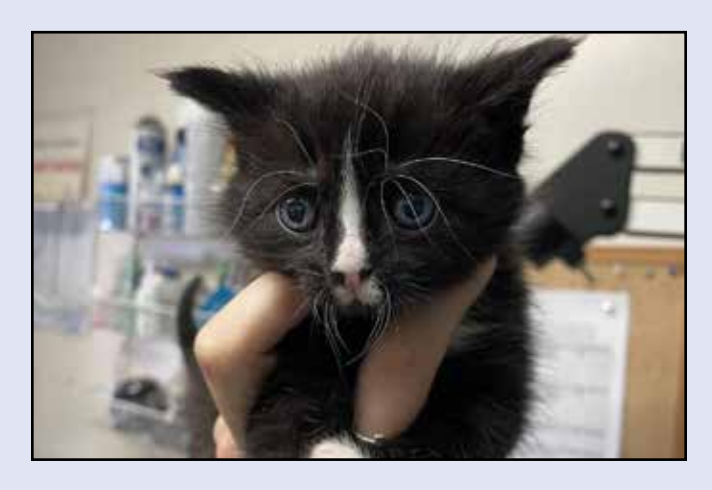
Skimmer may look like an old man, but he is in fact just a baby