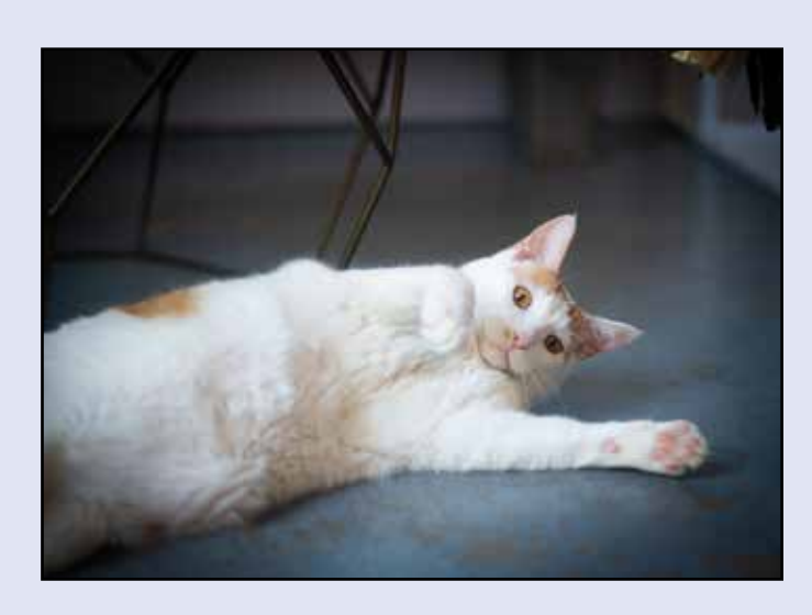
Our sweet girl Penne is loving the lounging life at Cat Therapy.

ASAP Cats staff and volunteers are providing medical and behavior support, and we will manage the adoption process for all of these cats, employing the virtual adoption model we developed during 2020. We like to think of Cat Therapy as a big foster home for our kitties, but they are all still ASAP Cats cats!