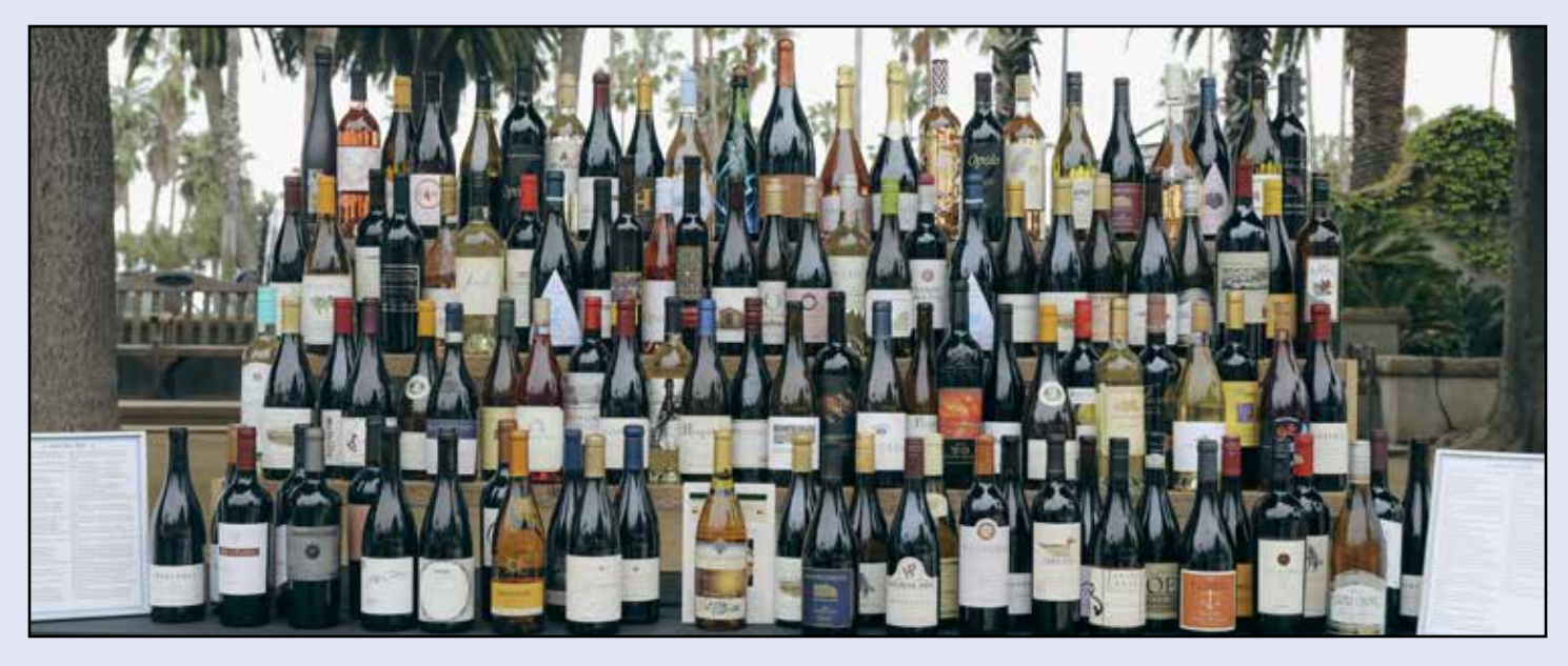
Our annual Live Auction Instant Wine Cellar was a huge hit, raising $4,500 for ASAP Cats.