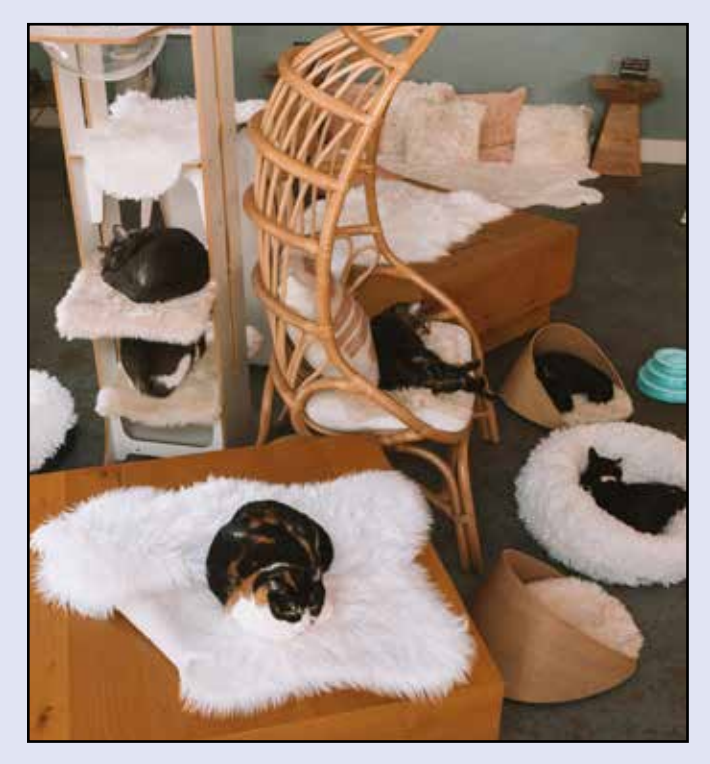
All the Cat Therapy kitties have their own favorite spots when it's catnaptime.

Our partnership began just a couple of months ago after we transferred the remaining cats in Catalina's care into ASAP Cats' custody. All 20 kitties came to ASAP Cats for a few days for routine check-in exams while Cat Therapy had the opportunity to do a brief refurbishment. As spaces become available when cats are adopted, we will send down additional cats from ASAP Cats to stay at Cat Therapy. Four of our ASAP kitties have moved down to Cat Therapy, including shelter veterans Lunar and Bond who have been waiting patiently to meet their forever families.