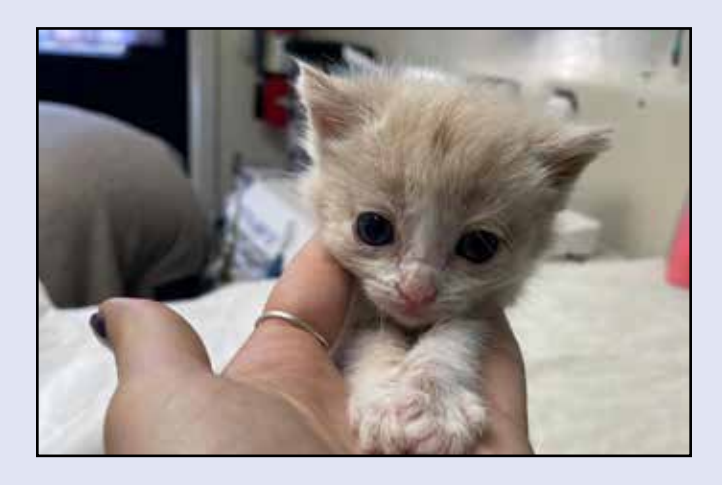
Milkshake loves to say hello to all the volunteers who check in on him.

If you are interested in adopting a special kitten with Cerebellar Hypoplasia, please consider meeting Milkshake, Skimmer, and Sandy at ASAP today.