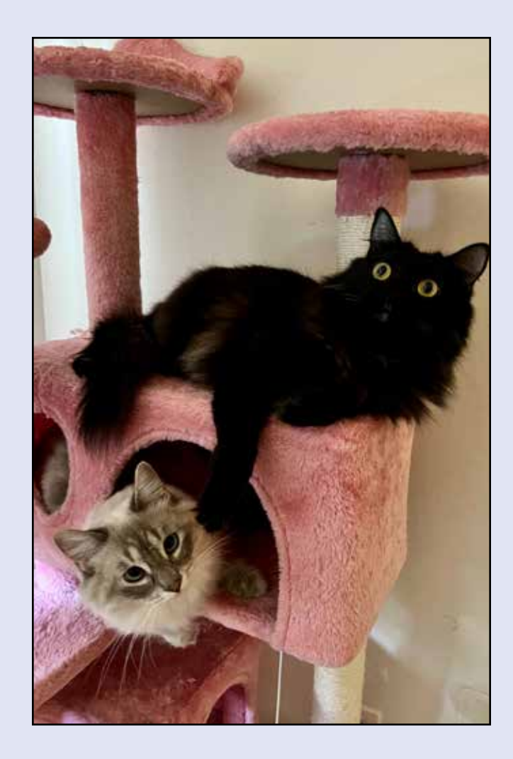
Mimi is very excited to have her best friend Momo home, happy and healthy.

If your cat receives an FIP diagnosis, ASAP can assist you with finding resources that can help you with treatment information.