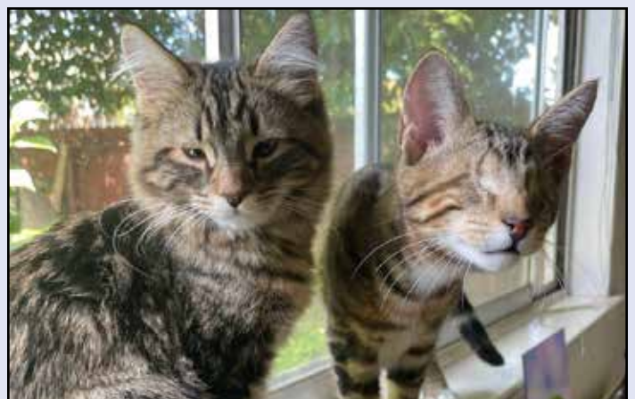
Though they came from a litter of six, these two shared an extra special connection, making them a bonded pair.

Now named Matty (after Matthew Murdock, alter ego to blind superhero Daredevil) and Maisel (after Mrs. Maisel), they are constantly showered with love and affection as the two get to explore their new home. After being trapped, their mother was spayed and returned to her neighborhood where she is being fed and living her chosen life as a community cat.