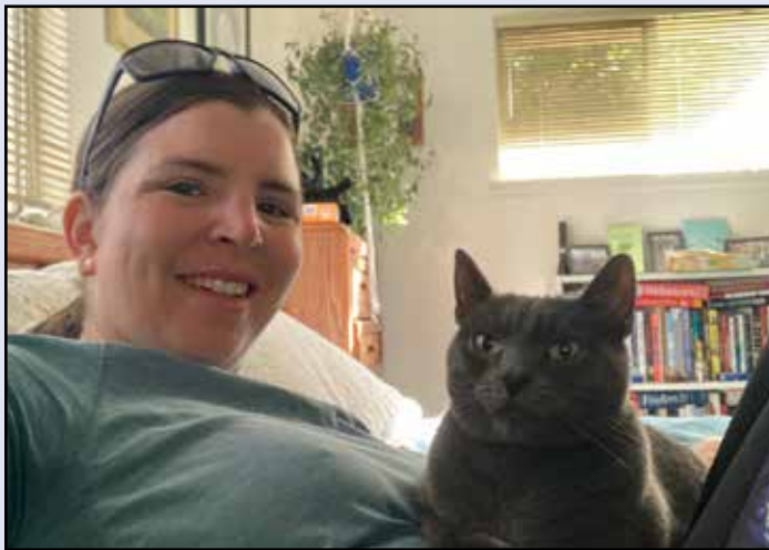
In addition to being a ball of energy, Stuey loves getting comfortable in a warm lap.

In our Cat Chat binder at the shelter, I wrote: "Checked on Stuey...A note on his cage says 'get me out of here.' He doesn't like the shelter; it is hard to know what his personality is really like because he doesn't like the shelter, so we can foster him." I decided to give Stuey a break from the shelter.