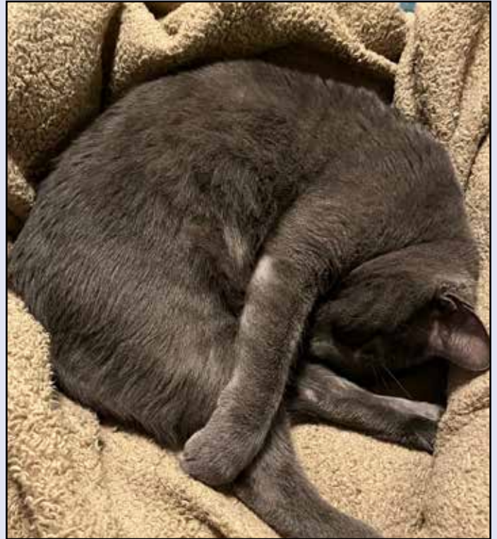
Stuey loves to curl into a ball whenever there's a comfy blanket around. He loves to lounge!

For several weeks after his arrival, Stuey hid in a bunk bed amongst a bunch of stuffed animals, hissing if anyone approached him, only leaving the bed to eat and use his litter box when no one was in the room. Gradually my daughter got him to