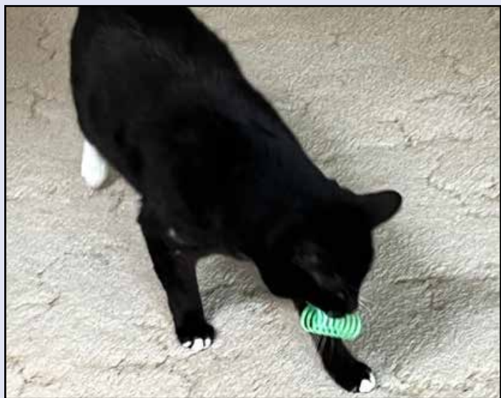
Jinx benefitted heavily from getting a chance to stay at foster before being adopted. Most cats do!

A couple of months later, I was no longer "Jinxed" and I found my forever home! I was so excited, and when I met my family in my new home, she was very loving and made me feel like a queen!