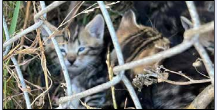
Six beautiful, fat, healthy, brown tabby babies, all born outdoors and currently adopted to loving homes. Pictured on the left is Ariel.

Once at the shelter, we determined that the babies were so close to being weaned that we did