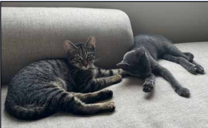
Brownie and Cookie, two bonded Tiny Lion graduates currently available for adoption at Cat Therapy.

Adopting a Tiny Lion is similar to your typical adoption process, but their introduction into a home may need a little more patience. Because these kittens have never lived in a home before,