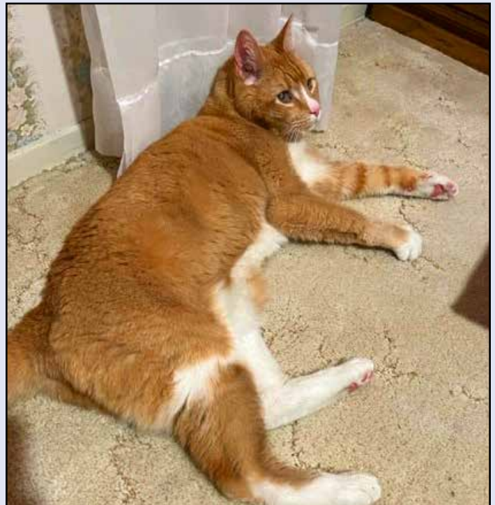
A youthful cat with a long past, Clarence has been enjoying the opportunity to lounge in a new space.