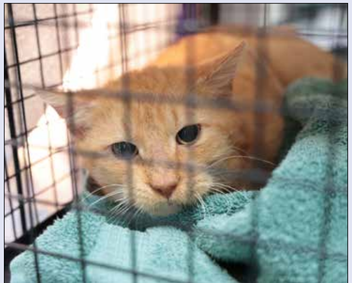
Now that he's feeling better, Skippy's true personality has returned. We're glad he's unafraid to express his boundaries now that he's comfortable again!