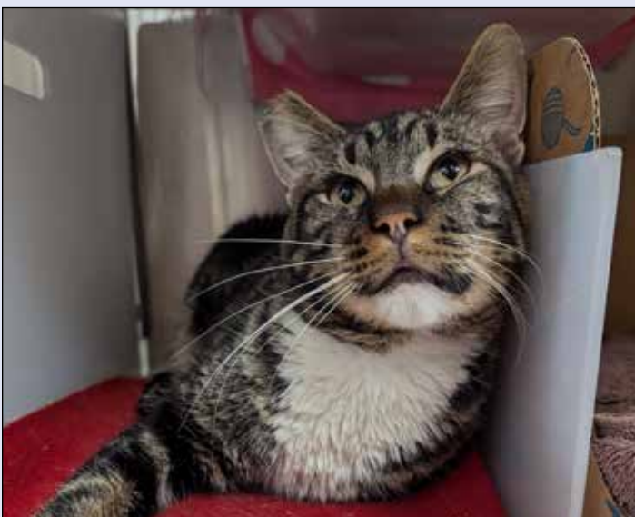
Despite extracting majority of his teeth, Kevin still has quite the appetite and a positive attitude!

The main preventative treatment is regularly bringing your cats in for check ups with your vet. Routine exams can catch diseases like stomatitis early, so establishing care with a vet and regularly bringing your cat in is your first line of defense. Additionally, take note of your cat's dental hygiene. Early signs mimic that of gingivitis, including inflamed or swelling gums, bad breath, excessive drooling, and pain when eating, so we recommend having your cat's oral hygiene monitored regularly. There are several over-the-counter cat toothpastes that could be used to brush your cat's teeth, too, so talk to your vet to see what they recommend!