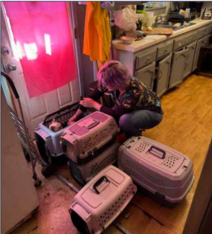
When it comes to saving kittens, Athena Brown is always ready to spring into action!

The six friendly, healthy cats will likely be adopted quickly, a result of ASAP's quick action and solution-centered approach to community outreach and service. Another successful community rescue from the ASAP Cats team!