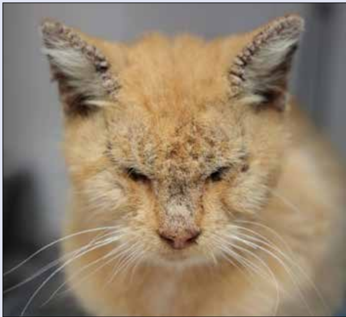
Uncomfortable and irritated, Skippy's low energy upon intake allowed our team to handle him with ease.

Meet Skippy, a 10-year-old stray found in Isla Vista, initially brought to the shelter covered in scabs and the classic markers of scabies. Having a scraggly appearance of crusty, flaky skin and plenty of mite bites, Skippy initially seemed very low energy, yet he still had quite the appetite and was most active when eating. After staying with ASAP for a few weeks, his scabies began to clear up and his true personality began to shine through – albeit a little grouchy and slightly less happy being handled.