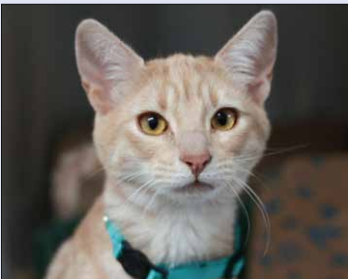
Simba is currently healing well at home, while his family keeps ASAP updated on his condition.

His stomach began to bloat, and while still cute as a rotund little guy, it was clear Simba was growing uncomfortable. The emergency clinic where Simba's family brought him diagnosed FIP and recommended euthanizing the young cat, but thankfully Simba's family reached back out to ASAP. Having treated several cats with FIP, our Wellness team was prepared to step in and rescue Simba from his predicament.