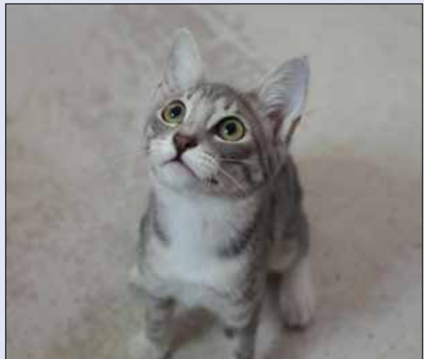
Monet, our 9-month-old Manx kitty, loves to run around and chase lizards. Visit her at the shelter!