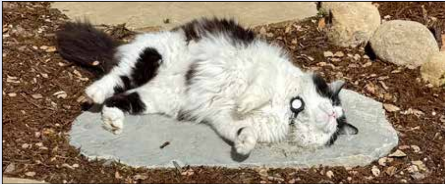
Sunbathing has always been one of Delorean's favorite pastimes.

Delorean's ASAP journey began in early 2024 when he was surrendered to ASAP by an owner who could not keep him due to personal circumstances. Unfixed, unbothered, and plenty social, Delorean's popularity at ASAP knew no bounds, as he enjoyed time gallivanting around the outdoor runs and impressing volunteers and staff alike with his good looks and confident demeanor.