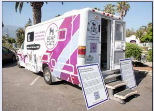
Sporting a brand new wrap revealed at our Bash earlier this year, we're thankful to our partners at C.A.R.E.4Paws for donating their van to us.