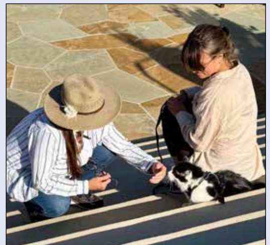
Preferring to be the star of the show, Delorean adores getting all the attention from anyone willing to give it to him.