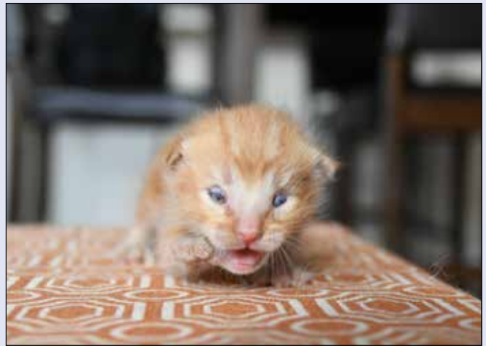
Baby Banana at 2 weeks, still a silly little bowling ball with a rough road of medical procedures ahead of him.