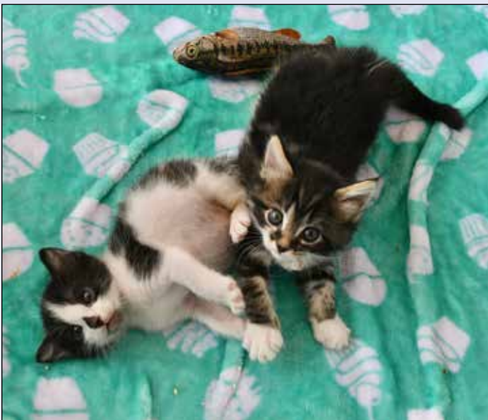
Ahi and Scott at 5 weeks. Eyes fully opened, their distinct personalities begin to develop.

Due to their high vulnerability, it's especially important to collect as much data as possible when fostering neonatal kittens – though this truly applies to fostering cats of all ages. "Keeping track of all of their markers of health to ensure they're healthy and growing is the most