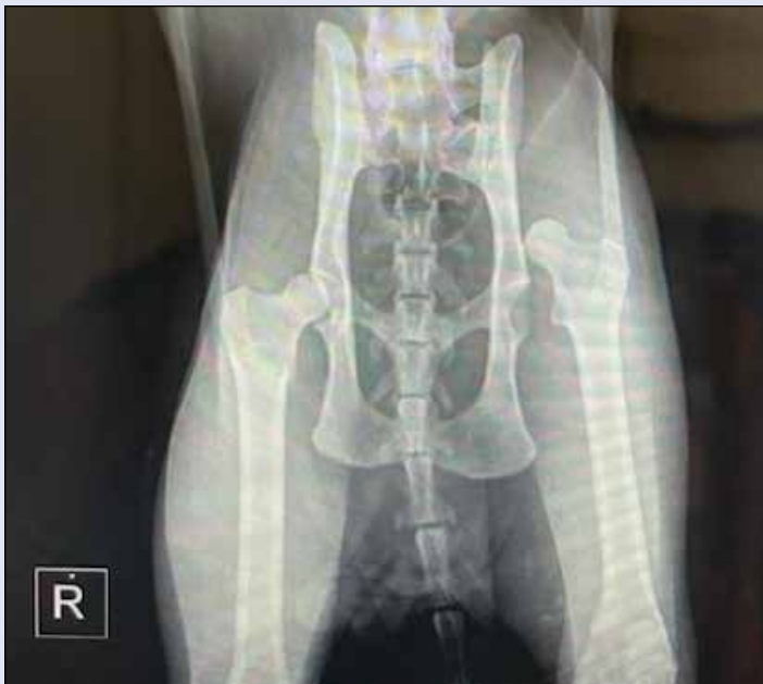
McGee's dislocated hip that could not be reset due to the length of time it had been out of the socket.

Following Lucky McGee's recovery, he'll transition to the Alternate Placement track, where our dedicated team will work to find a suitable home fit for the fortunate boy.